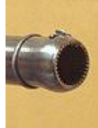
Rifling of the Lepage carbine.

During the Napoleonic Wars the British army created several experimental units known as "Rifles", armed with the Baker rifle . These Rifle Regiments were deployed as skirmishers during the Peninsular war in Spain and Portugal, and were more effective than skirmishers armed with muskets due to their accuracy and long range.