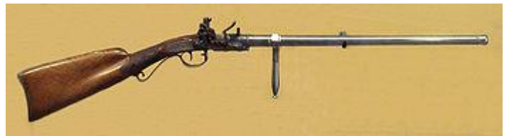
"Premier Consul" model flintlock carbine made by Jean Lepage and named for the First Consul Napoléon Bonaparte , circa 1800;