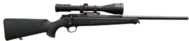
Blaser R8 Professional

During and after World War II it became accepted that most infantry engagements occur at ranges of less than 300 m; the range and power of the large battle rifles was "overkill"; and the weapons were heavier than the ideal. This led to Germany's development of the 7.92x33mm Kurz (short) round, the Mk42 , and ultimately, the assault rifle. Today, an infantryman's rifle is optimized for ranges of 300 m or less, and soldiers are trained to deliver individual rounds or bursts of fire within these distances. Typically, the application of accurate, long-range fire is the domain of the marksman and the sniper in warfare, and of enthusiastic target shooters in peacetime. The modern marksman rifle and sniper rifle are usually capable of accuracy better than 0.3 mrad at 100 yards (1 arcminute ).