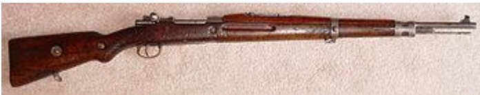
Czechoslovak rifle vz. 24

The Russo-Japanese War of 1904-1905 was the first modern war of the 20th century. Military observers from Great Britain, Germany, France, and the United States witnessed first-hand the first major conflict fought with high velocity bolt-action rifles firing smokeless powder on a massive scale. The Battle of Mukden fought in 1905 consisted of nearly 343,000 Russian troops against over 281,000 Japanese troops. The Russian Mosin-Nagant Model 1891 in 7.62mm was pitted against the Japanese Arisaka Type 30 bolt-action rifle in 6.5mm, each had velocities well over the 19th century black powder velocities of under 2,000 feet per second (610 m/s).